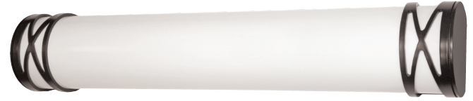
BZ endcaps, WHA diffuser