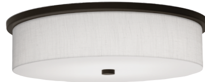
BZ finish, WHL diffuser