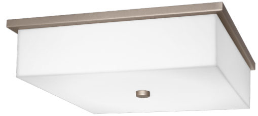
MB finish, WHA diffuser