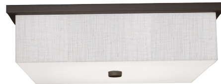
BZ finish, WHL diffuser