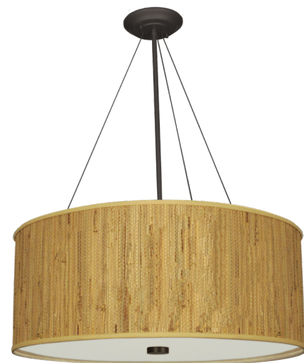
BL finish, GR1 diffuser