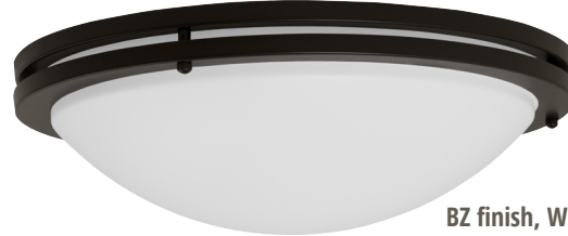
BZ finish, WHA diffuser