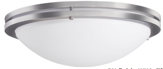
BN finish, WHA diffuser