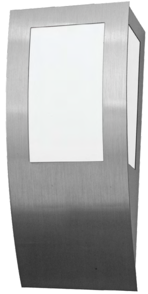
BN finish, WA diffuser