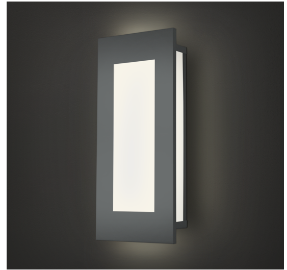
NT finish, WHA diffuser