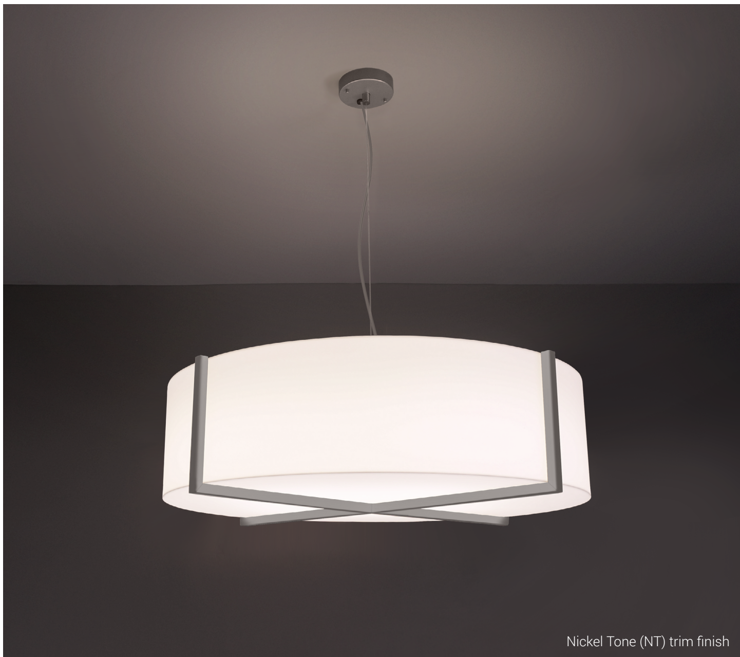
Nickel Tone (NT) trim finish