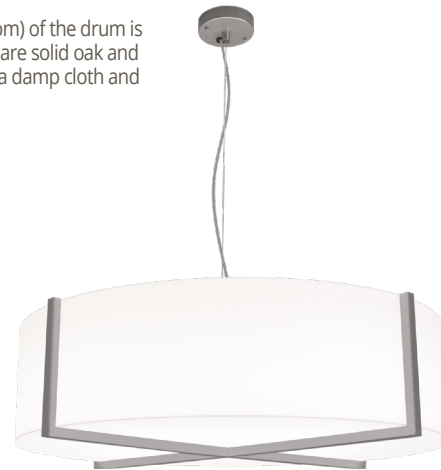
NT suspension finish, NT trim finish, CC1 suspension