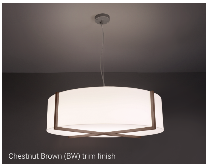
Chestnut Brown (BW) trim finish