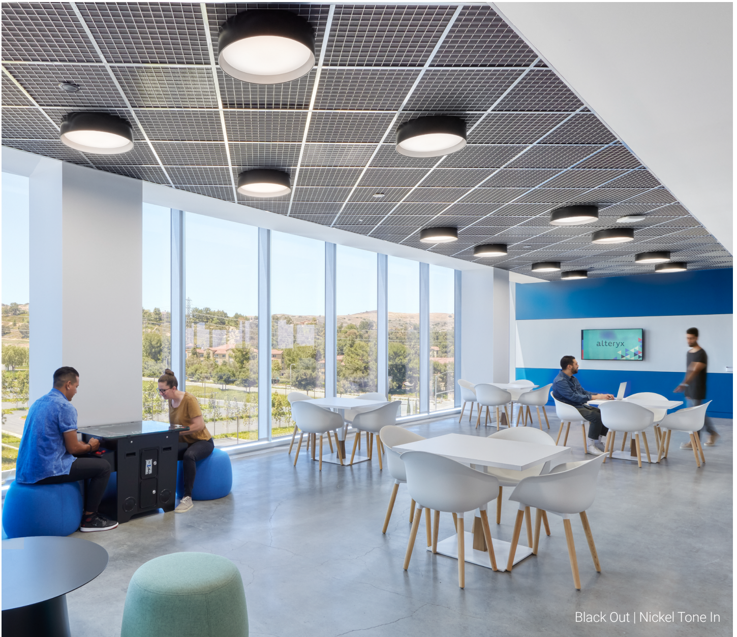
Black Out | Nickel Tone In