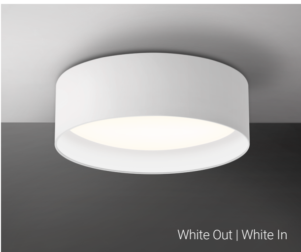
White Out | White In