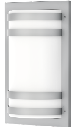
NT finish, VB0 trim