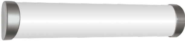
NT endcaps, WHA diffuser