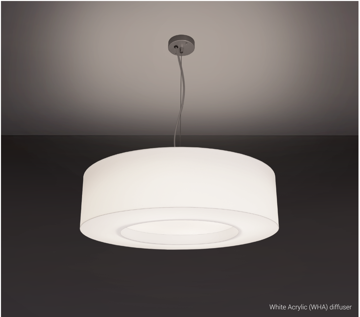
White Acrylic (WHA) diffuser