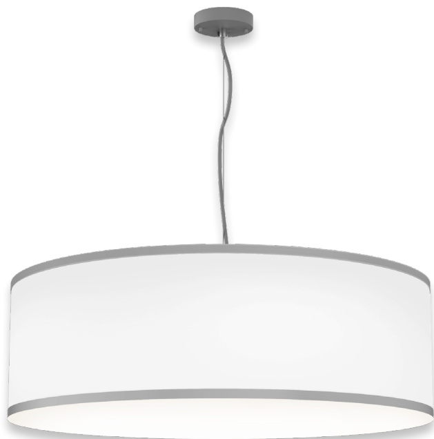
NT finish, WHA diffuser, CC1 suspension