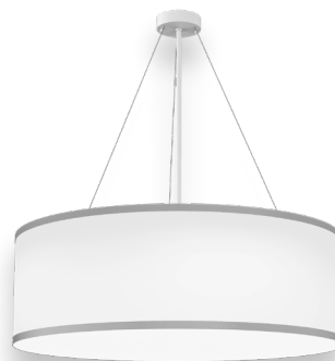
WH finish, WHA diffuser, SCM suspension

SSM - Single Stem Mount: Traditional pendant style. Steel stem in your choice of finish. The standard overall height (OAH) can be extended with additional stem sections in 1' and 2' intervals - see accessories section. Recommended for pendants up to 36"Ø only.