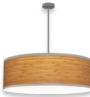
NT finish, BMB diffuser, SSM suspension