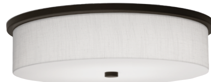
BZ finish, WHL diffuser