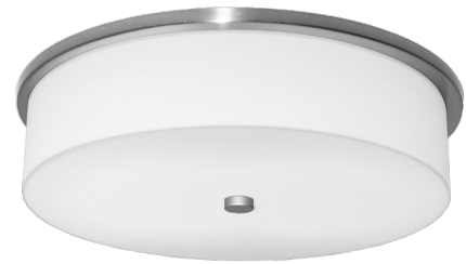
BN finish, WHA diffuser