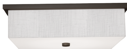
BZ finish, WHL diffuser