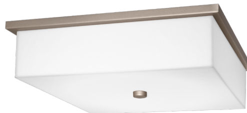
MB finish, WHA diffuser