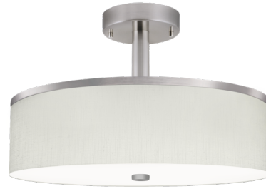
BN finish, WHL diffuser