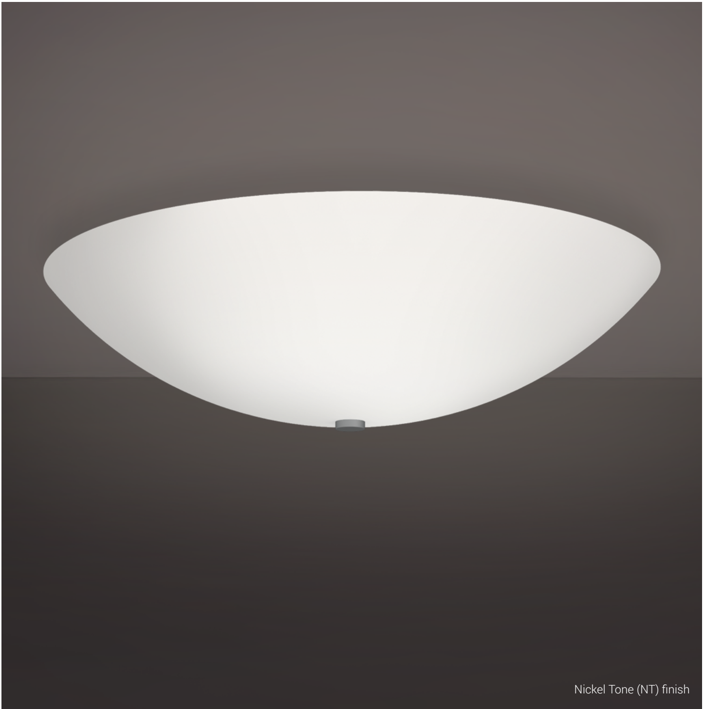
Nickel Tone (NT) finish