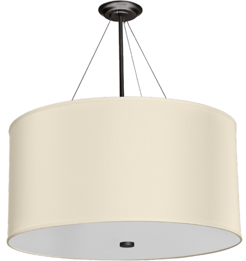
BZ finish, SP3 diffuser