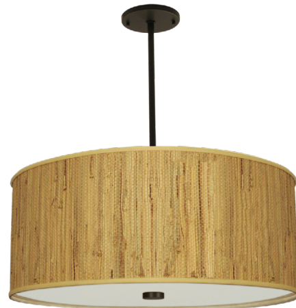
BL finish, GR1 diffuser