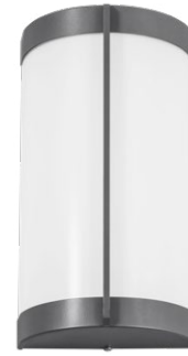
GM finish, WHA diffuser