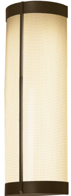
MB finish, GDM diffuser