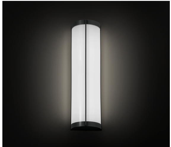
NT finish, WHA diffuser